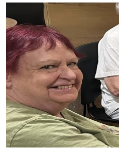
Sherrill Eads Events