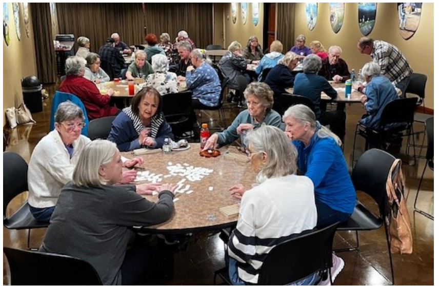
FULL HOUSE FOR MEXICAN TRAIN

Once you have com- mitted to attend an activity, each chair- person and the venue is counting on your at- tendance. Please do the polite thing and don't "no show"