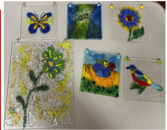
Samples of glass art made by our members at the January class