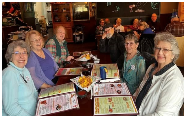
New Years Eve at La Burrita!

CARD BINGO TUESDAY FEBRUARY 11TH 1-4PM FRUITDALE GRANGE ITS EASY! ITS FUN! DOOR PRIZES! REFRESHMENTS SERVED