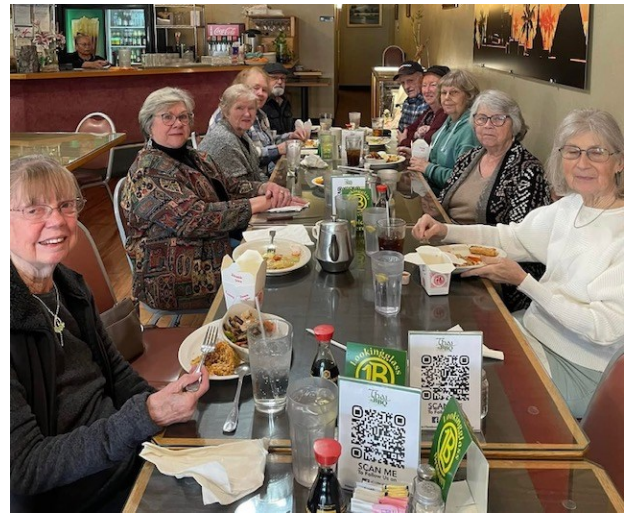
Lunch at Thai Bar-B-Q 1/14/25

The total collected is divided 50% to the club and the other 50% goes to the winner.