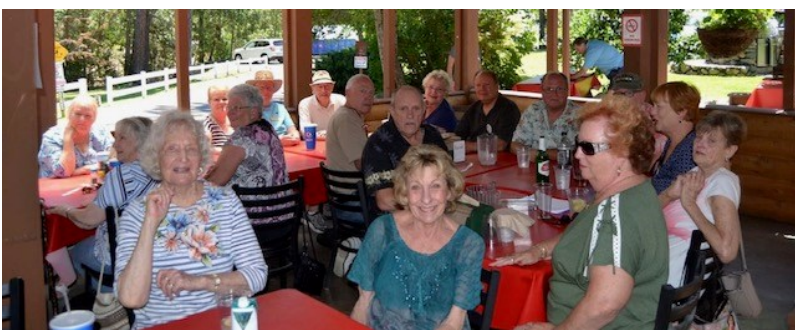
Flash back! Who do you recognize from this photo Janice Evans took July 2018! Watch for more oldie but goodies in coming months